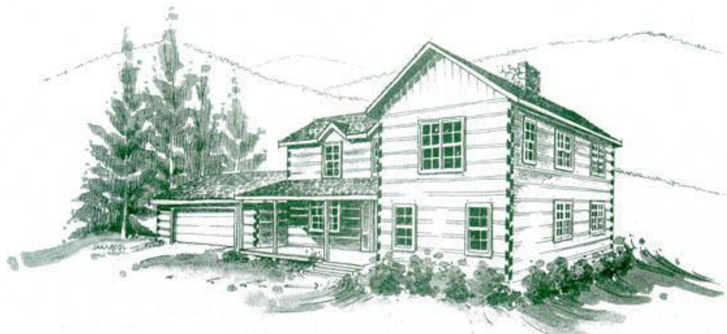
CEDAR BLUFF 2662 4 2 ½